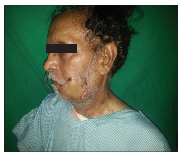
Figure 2: Patient showed good post-operative course